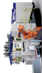
MILL-TURN MULTI-SPINDLE MACHINES