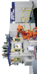
MILL-TURN MULTI-SPINDLE MACHINES