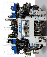
FLEXIBLE TRANSFER MACHINES